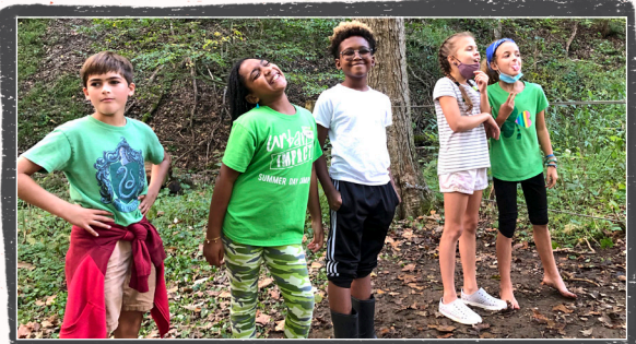
60 parent volunteers organized and ran PUCS Camp at Camp Ligonier & Conference Center.